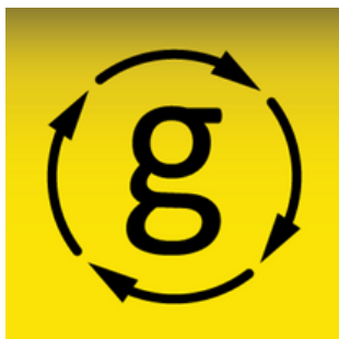
Small G-Protein Products

This is the perfect time to try our popular tools, and bundle them with our G-LISA kits!