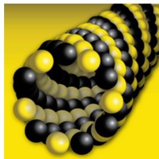
Tubulin Protein Products